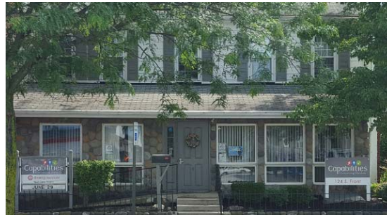
St. Marys, OH